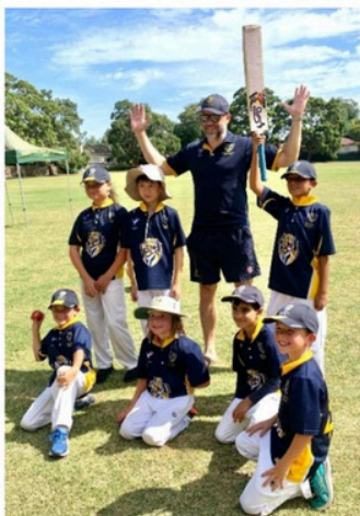
Balwyn CC Under 10s