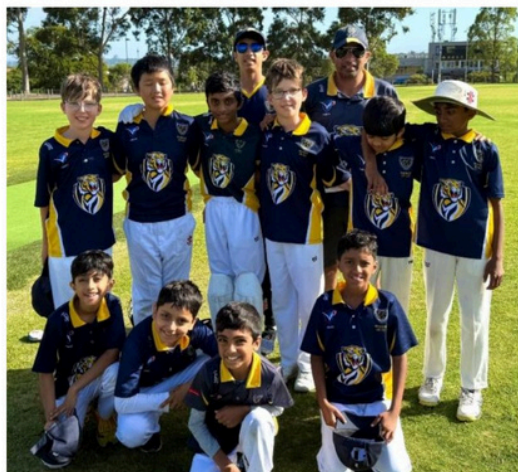
Balwyn CC Under 12s