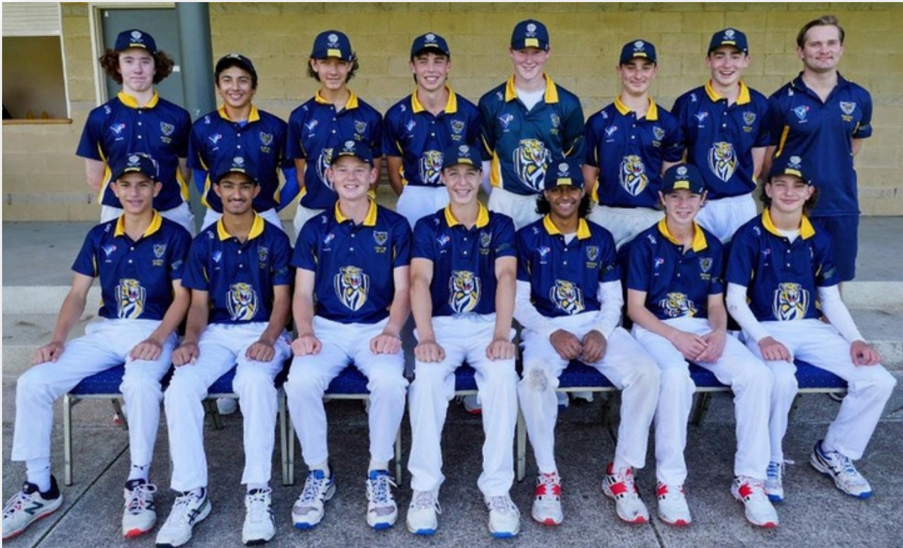
VSDCA Under 15 J.G. Craig Shield