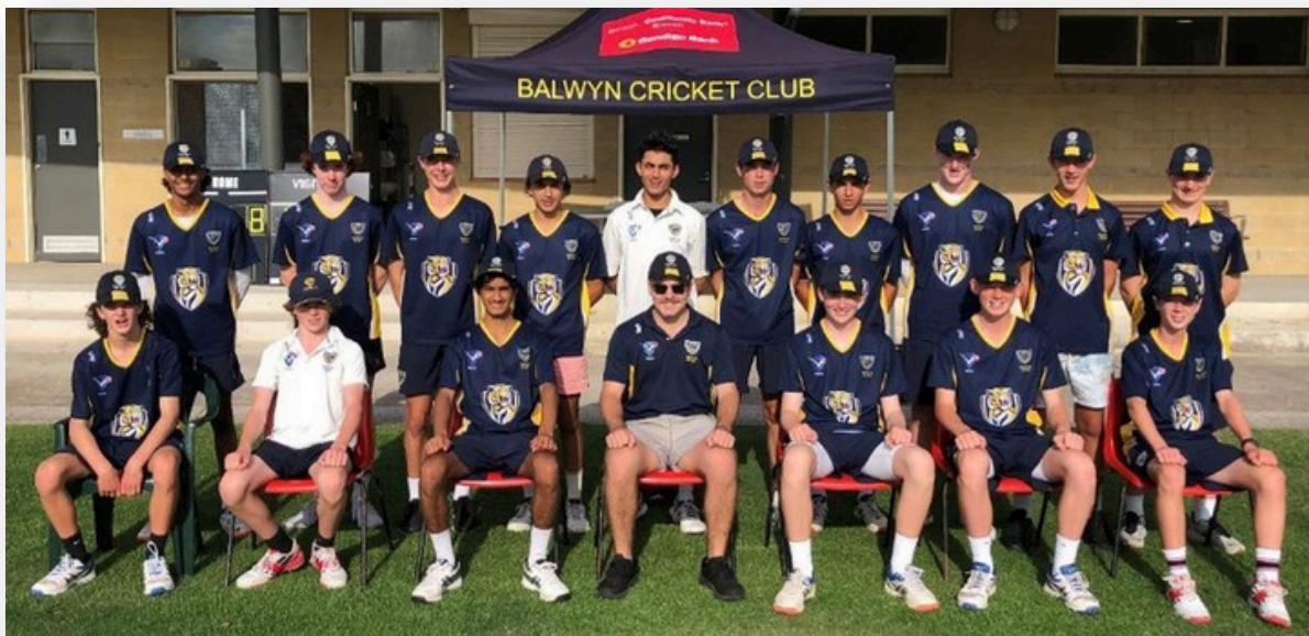
Balwyn Tigers Under 15A Team